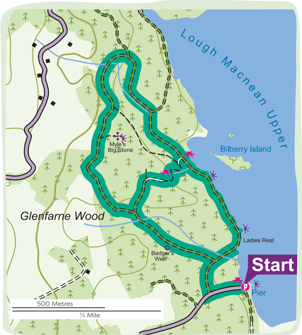
OSi Map Series: Discovery Series – Sheet 17

TRAILHEAD / STARTING POINT: Glenfarne Forest Demesne H015 405